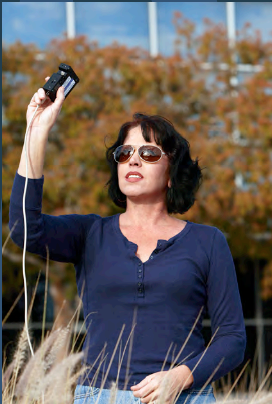
Solar Irradiance Measurements with USB2000+ Miniature Spectrometer